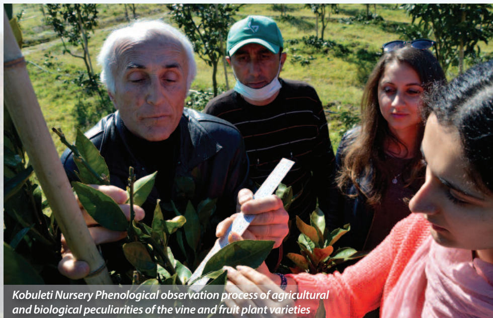
Kobuleti Nursery Phenological observation process of agricultural and biological peculiarities of the vine and fruit plant varieties

The programme will benefit the whole of Georgia, while its concrete rural development actions will be implemented in selected municipalities of the country.