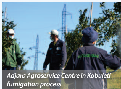
Adjara Agroservice Centre in Kobuleti – fumigation process

support the government to upgrade laboratory capacities, food safety and SPS standards for inspection and control. It will support the strengthening of border inspection and controls and the upgrading of food import and export standards, and encourage farmers to abide by them – a crucial step if they are to sell their products to the large European market through the DCFTA.